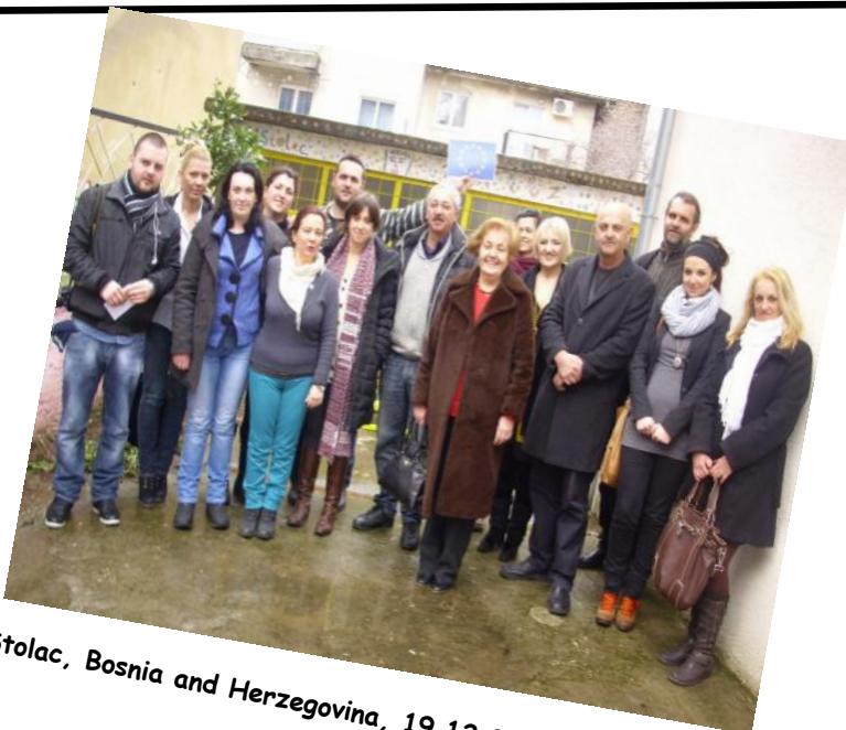
Stolac, Bosnia and Herzegovina, 19.12.2013

The partner staff of Ugorhideja and Tamat meet the first time in Stolac ! We shared project objectives, aims and we planned together our next steps!